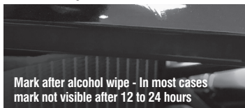
Mark after alcohol wipe - In most cases mark not visible after 12 to 24 hours