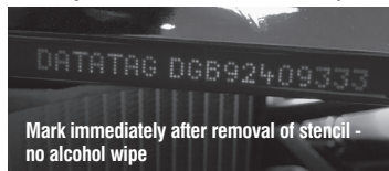
Mark immediately after removal of stencil - no alcohol wipe